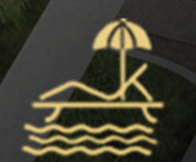
A Luxurious & Large Leisure Pool Deck