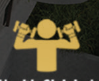
Full Health Club Indoor & Outdoor Gym