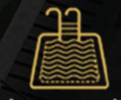
Apartments with Private Pools